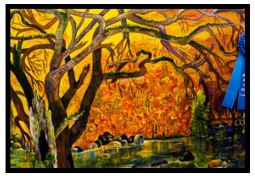
Esther Dirlam: Somewhere in Time