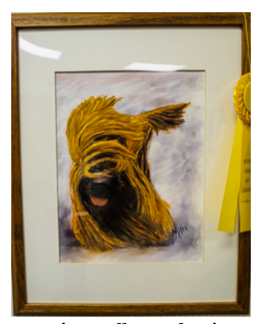
Maxine Wall: Bad Hair