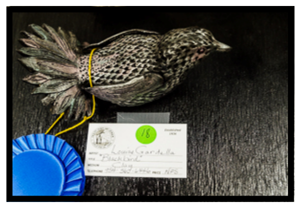
Louise Gardella: Blackbird