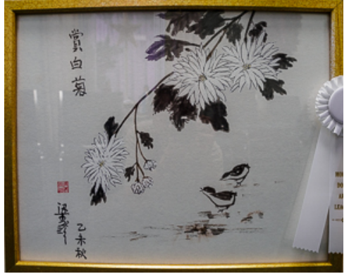
Jane Moody:Under The Tree