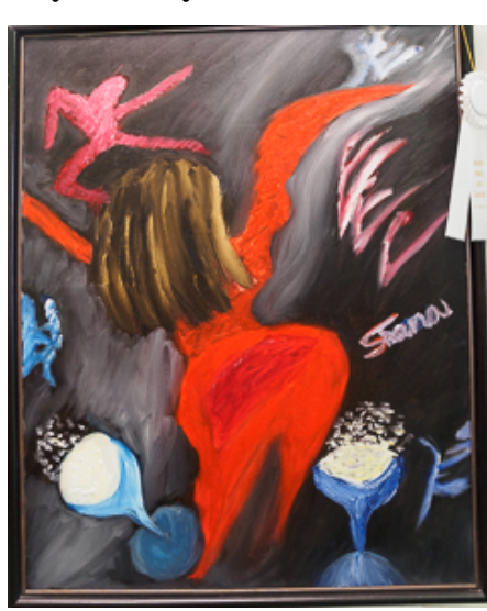
Shana Spooner:Bottoms Up