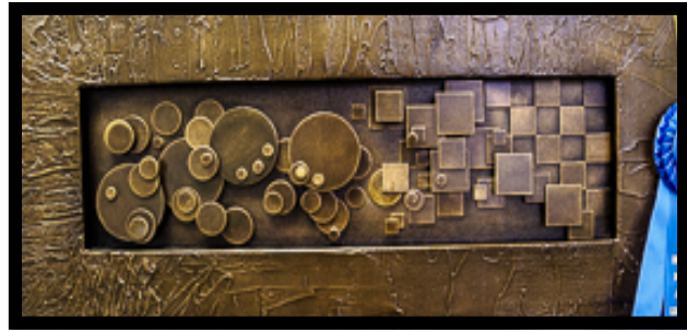
Cary diValentin: Cirlcle vs. Square