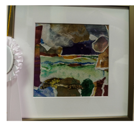
Peg Parsons: Hereafter