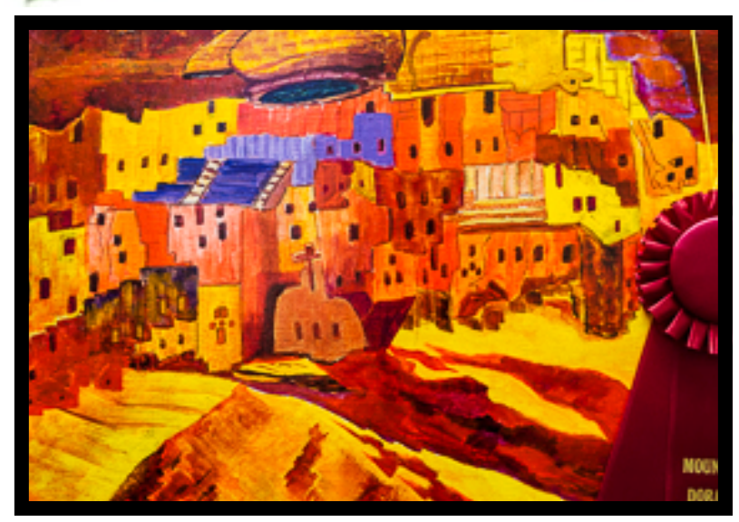
Esther Dirlam: Many Points of View