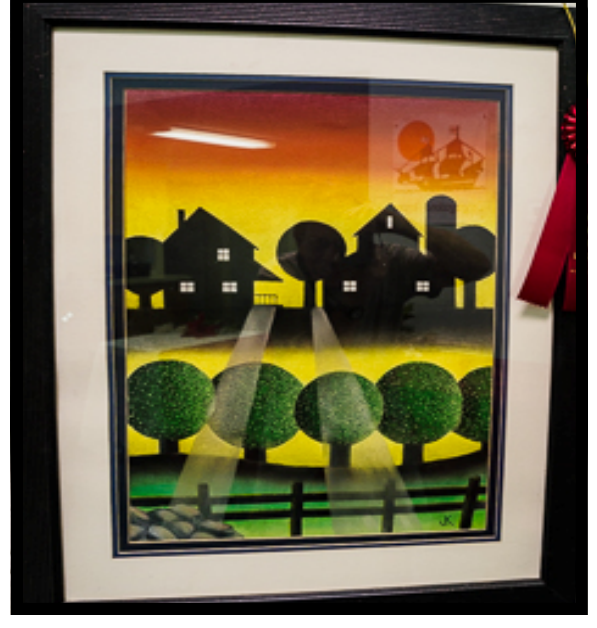
J.Kautenburger:If Trees Could Talk