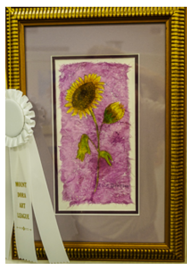
Alice Dressner: Sunflower