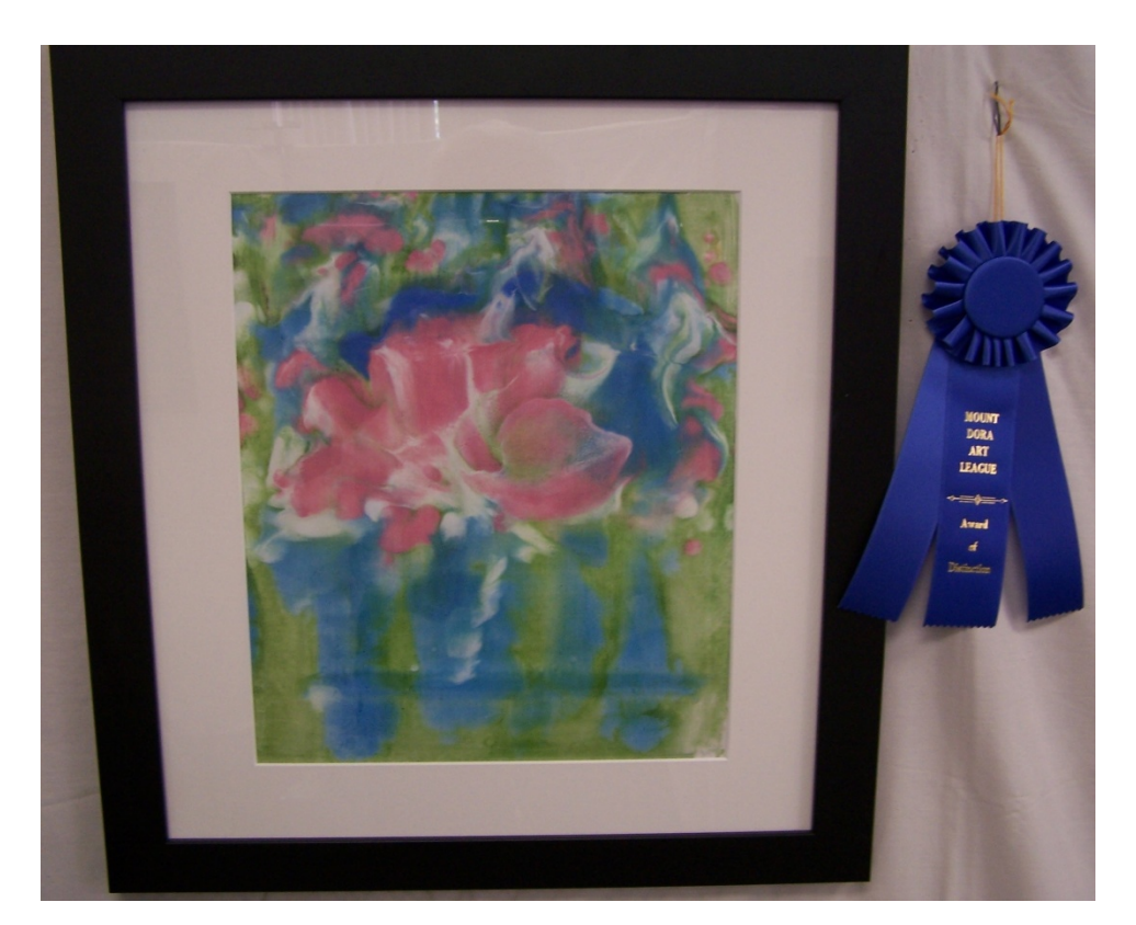
CARRIE KNUPP – ENCAUSTIC – "PETALS IN PINK"

CLAIRE FAIRCLOUGH – OIL – "RED BOATS IN YORK"