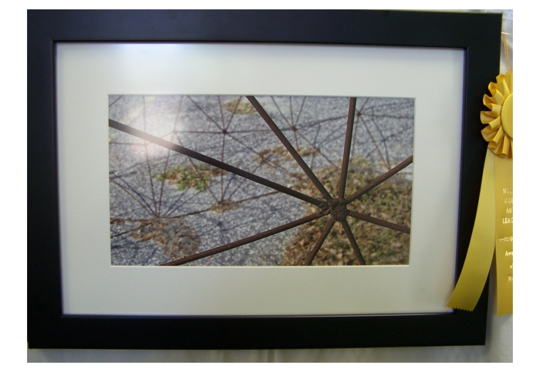
CARRIE KNUPP – PHOTOGRAPHY – "SPOKES"