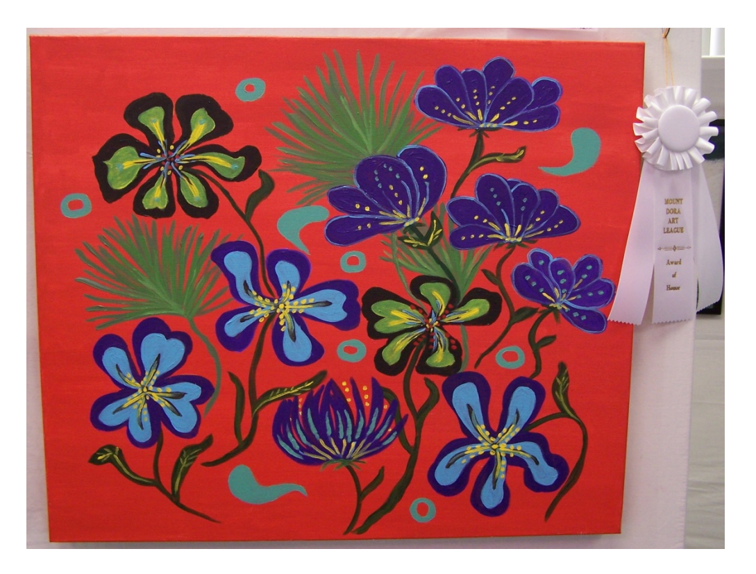
SYLVIA PAISLEY-GEE – ACRYLIC – "MIDNIGHT GARDEN"

PHYLLIS LEVEE – 3D CLAY – "SOMETHING FISHY"