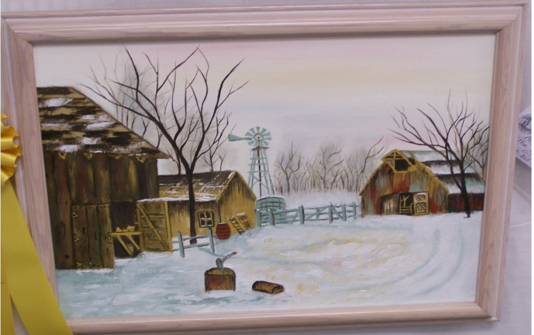
ALICE DRESSNER – OIL – "THE OLD BARN"