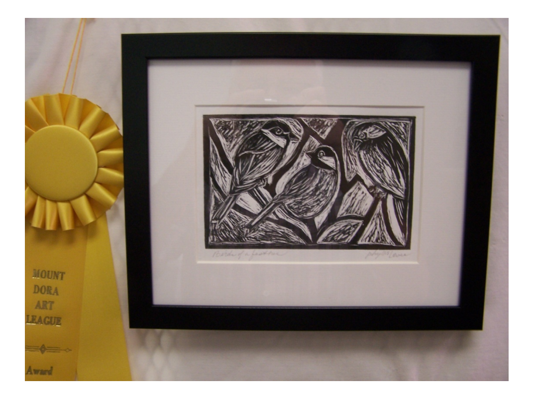
PHYLLIS LEVEE – GRAPHICS – "BIRDS OF A FEATHER"