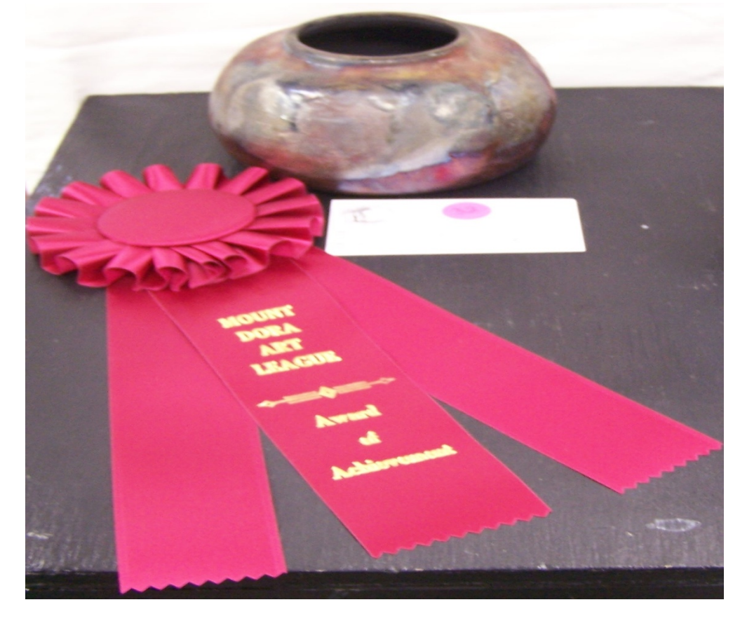
LOUISE GARDELLA – 3D CLAY, RAKU – "UNTITLED"